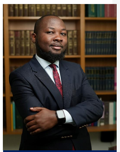
LL.B. (University of Nairobi), Pg. Dip. Law (KSL)