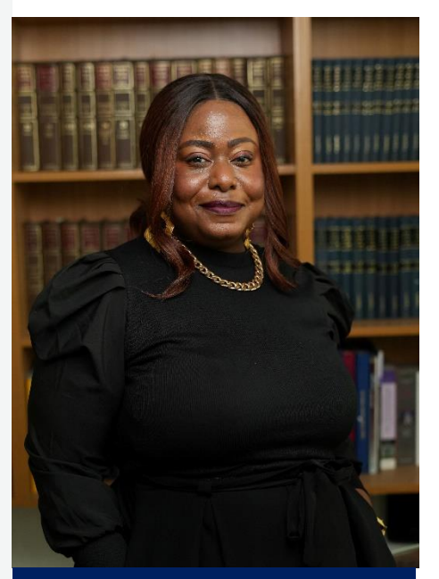
Ph.D. Candidate (University of Cape Town), LL.M. (University of Cape Town), LL.B. (Mount Kenya University), Pg. Dip. Law (KSL)