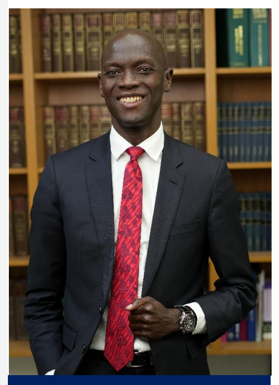
LL.M. (University of Edinburgh), LL.B. (University of Nairobi), Pg. Dip. Law (KSL), MCIarb